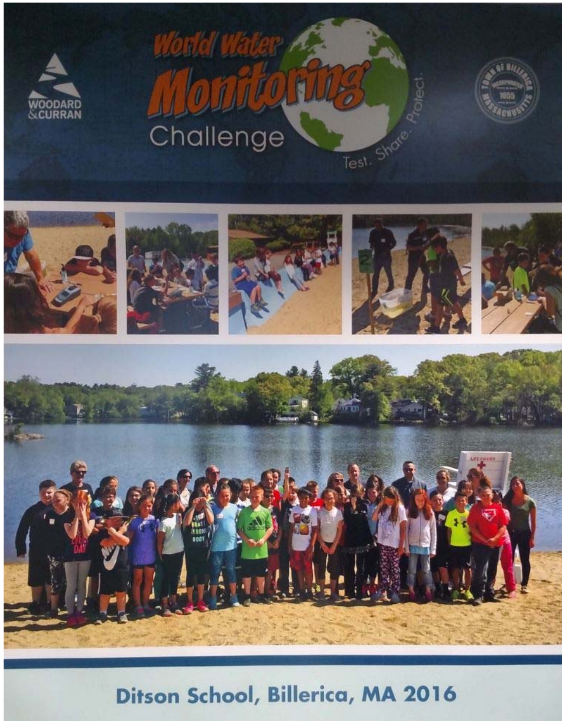
Ditson School, Billerica, MA 2016